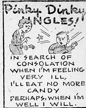
IN SEARCH OF CONSOLATION WHEN I'M FEELING VERY ILL, I'LL EAT NO MORE CANDY PERHAPS, WHEN I'M WELL I WILL.