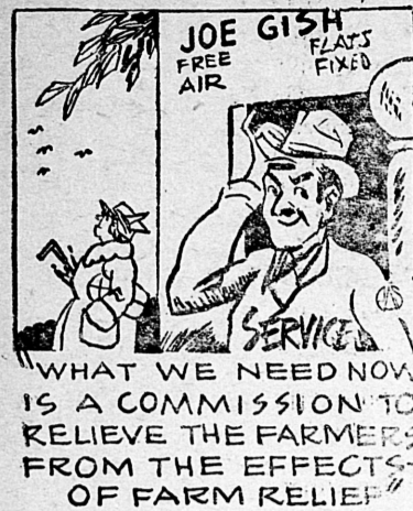
WHAT WE NEED NOW IS A COMMISSION TO RELIEVE THE FARMERS FROM THE EFFECTS OF FARM RELIEF

This 1931 weather is just about like the old worn-out weather that we used for the windup of 1930.