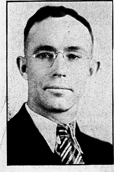
PRIMARY NEXT TUESDAY